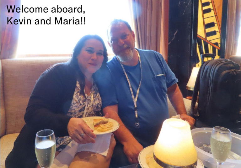
Juneau, capital city of Alaska Photo taken from upper deck of the Ruby Princess