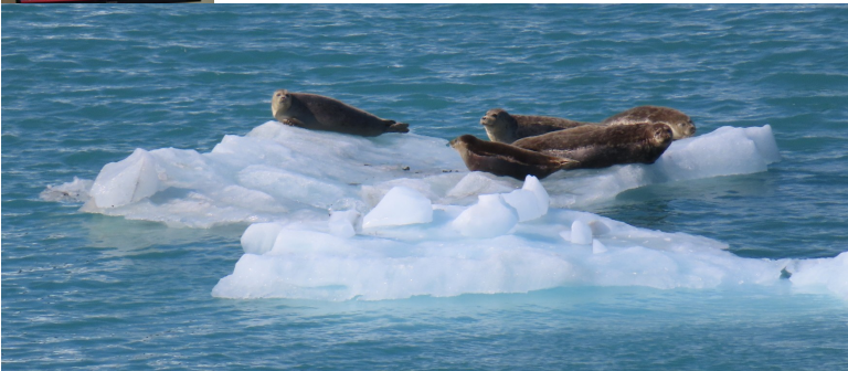
Seals were frequently seen like this, floating on ice.