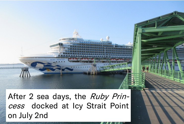
After 2 sea days, the Ruby Princess docked at Icy Strait Point on July 2nd

The pictures below were taken while docked at the ship’s first stop, Icy Strait Point , which is part of the town of Hoonah located on Chichagof Island . This location is the only private cruise ship destination in Alaska .