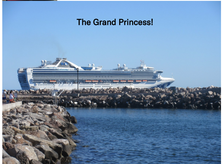
The Grand Princess!

One very significant factor about our experience was that because of the pandemic, there were only a hand full of guests on board with us, compared to what is normal. Of the 3 cruises we experienced, the total numbers fluctuated, between 200 and 400 guests. Normally the ship can carry about 2,600! I will include a photograph of our ship plus some of the Ports, plus guests we ate with and staff in the dinning room.