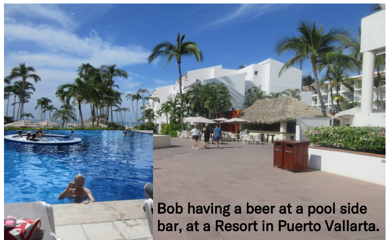
Bob having a beer at a pool side bar, at a Resort in Puerto Vallarta.