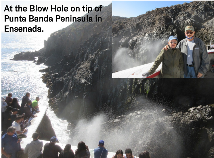
At the Blow Hole on tip of Punta Banda Peninsula in Ensenada.

W.C. BaJa With a boat heading back to ship to transport passengers to shore.