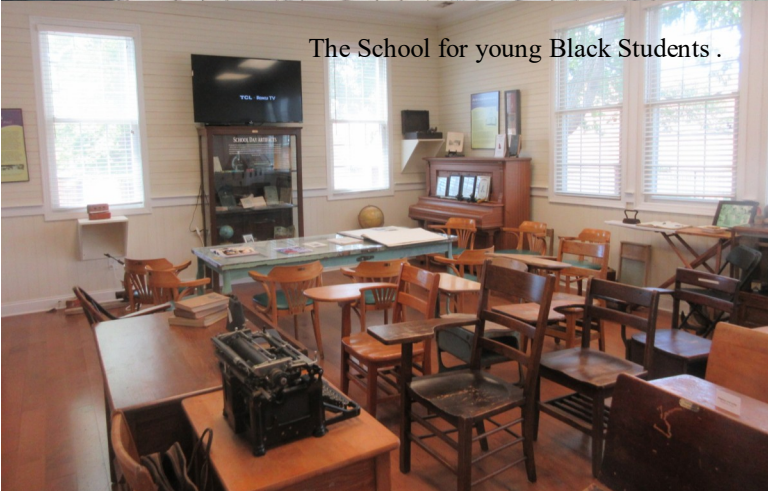
The School for young Black Students .