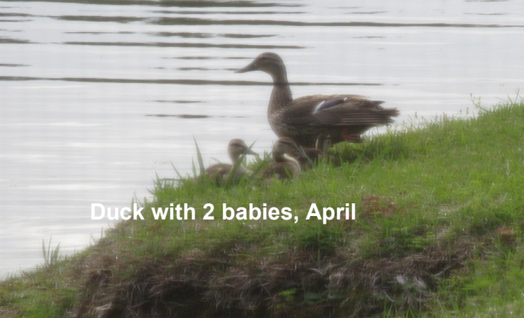
Duck with 2 babies, April

Am I exaggerating ???!! I don't think so!! Last year we had one goose family with 3 chicks, and now we have four plus 2 duck families. With the ducks, we have seen them only once. Where they go after that I have no idea. The most recent duck family had 10 babies. We are sure they had just hatched, as mom seemed to be trying to get them into the water for the first time. PS: As I write this newsletter, the mama duck to the right showed up again on June 7th with 9 out of 10 of her babies. The noise of the mowers brought her out!