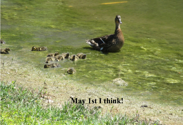
May 1st I think!