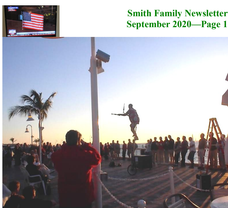
Watching the sun go down.....