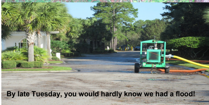
By late Tuesday, you would hardly know we had a flood!