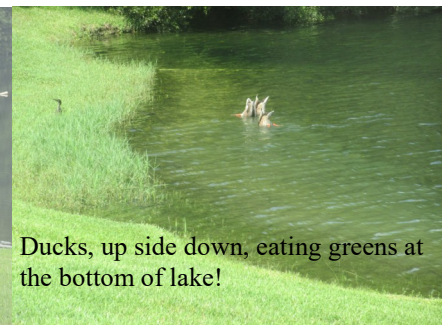
Ducks, up side down, eating greens at the bottom of lake!