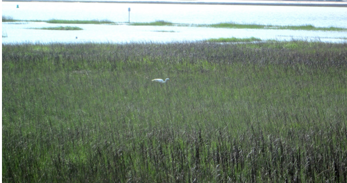
The picture to the left is of our resident Geese family strolling in front of our home.